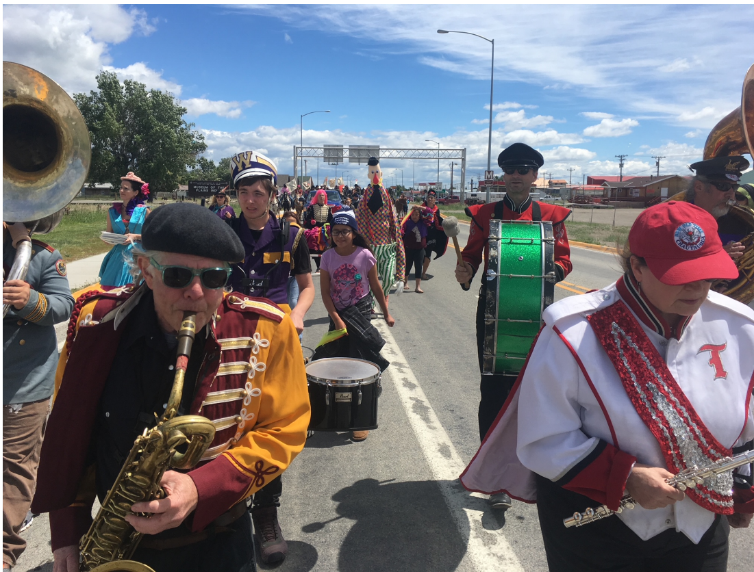
Parade in Browning, MT 2017 - Can you see the 100 horseback riders behind the band?