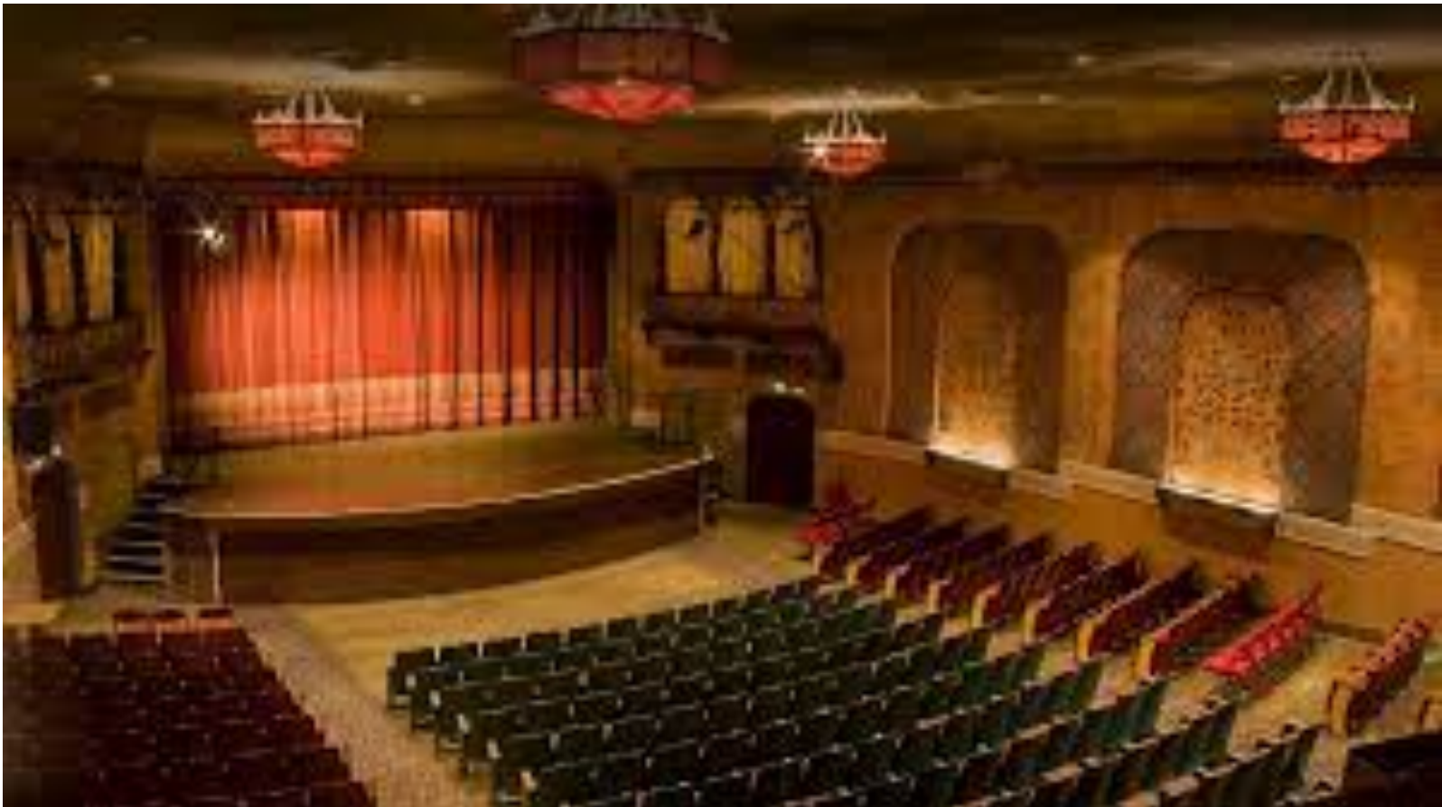
The Panida Theater in Sandpoint, Idaho - June 10